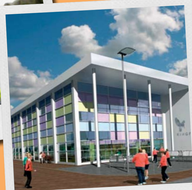
A computer illustration of Kingfisher School