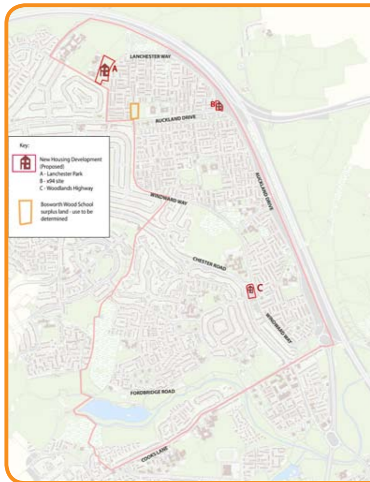
The North Area

Thank you to everyone who visited one of our drop-in sessions and gave their views. For more information please call us on, freephone, 0800 389 7997.