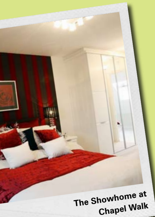
The Showhome at Chapel Walk