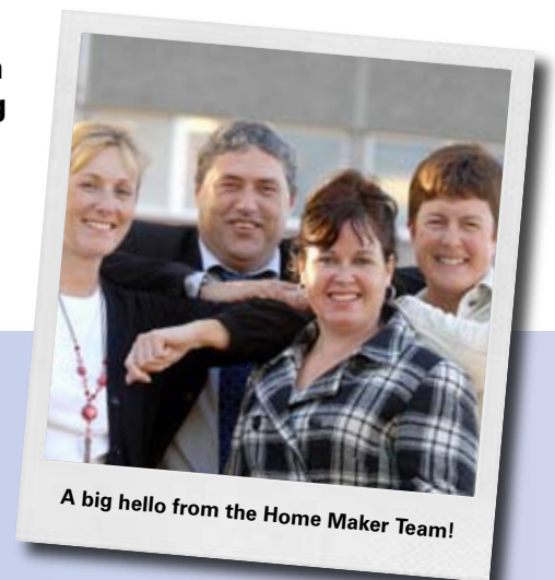
A big hello from the Home Maker Team!

If you would like more information on the re-housing process then call our free phone number on 0800 389 7997