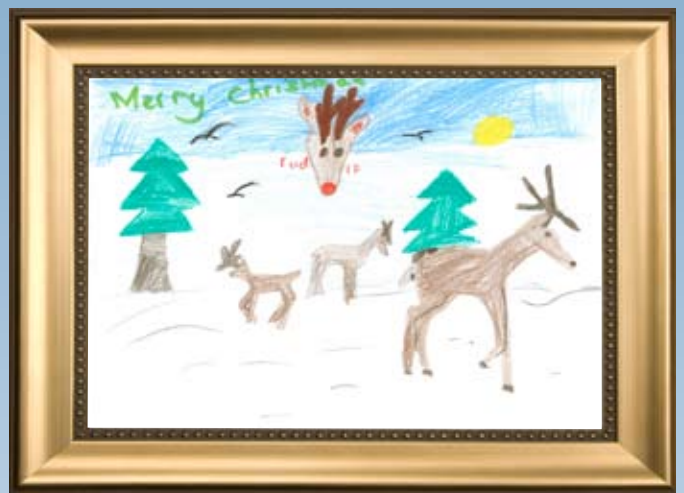
Helena Day, Class 4a